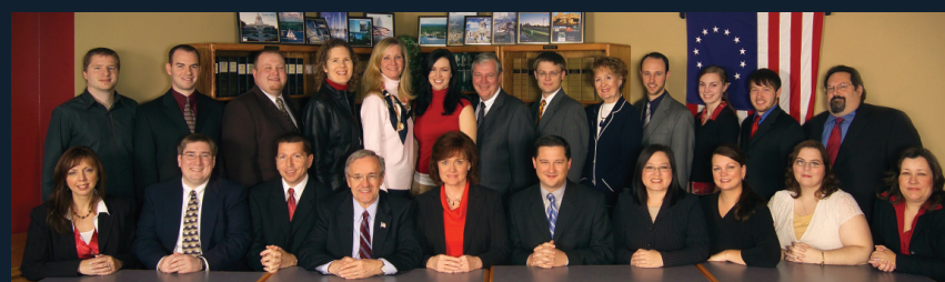
EFF Staff 2007

Evergreen Freedom Foundation PO Box 552 Olympia, WA 98507 360.956.3482 | www.effwa.org